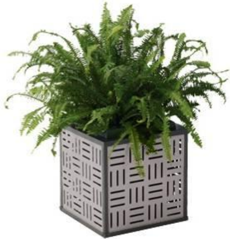
Parquet pattern shown.