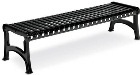
6 ft. model shown.

20-year limited structural warranty with 7-year finish warranty from the date of purchase