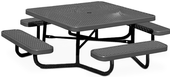
expanded steel model shown